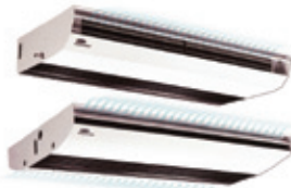
Single and exclusive dual discharge evaporators